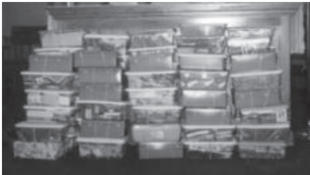
Filled boxes are stacked two deep in front of St. John's Chapel's altar.

Take a shoebox – or two or three (provided or purchase a plastic one). Based on the guidelines in the brochure, choose the sex and age group of the child who will receive your filled box. Now have fun filling the box! The brochure includes suggestions. Or you may want to fill your box with things you think the child will enjoy or appreciate. The Dollar Store is a great source for many of the items. The deadline to return boxes to either worship site is November 11 .