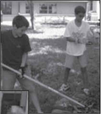
Teambuilding preparation by pulling up the floor of the FLC.