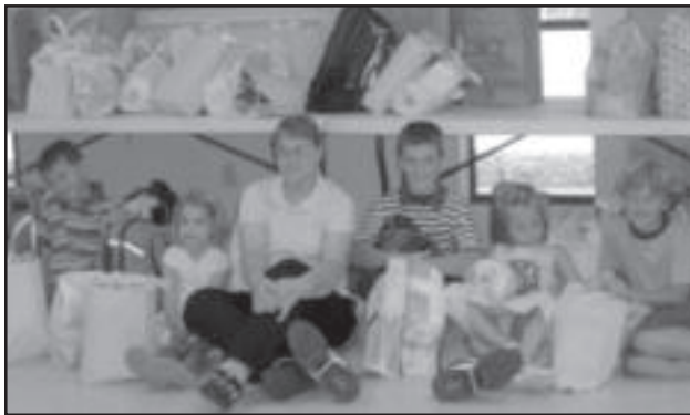
Some of the school bags that were given to the Feed My Lambs students last year.

Again this year, our Feed My Lambs Ministry will provide each of our children with a tote bag filled with the necessary back-to-school supplies. The parents and grandparents simply can't afford this extra expense. These school supply lists will be available after church on July 20. Sign up and help a child be prepared to start the new school year! Bags are due back to the church on August 10, and they will be hand-delivered on August 16.