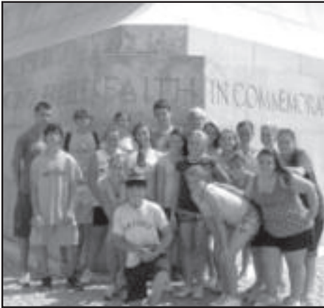
Pilgrims at the top of the Wright Brothers' Memorial.