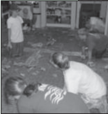
Watch for photos of the Tennessee and Navajoland mission trips in the next Word on the Riverbank!

The vision of the Church of Our Saviour is to be an ever-growing center for worship, spiritual growth and support for our parish family and the community by utilizing the beauty of the location and the talents of our dedicated members; and to be a leader in service, outreach, and mission as we go forth from this Holy Ground in the name of Jesus Christ.