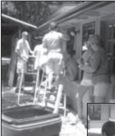
Tennessee Missioners prepare for their trip