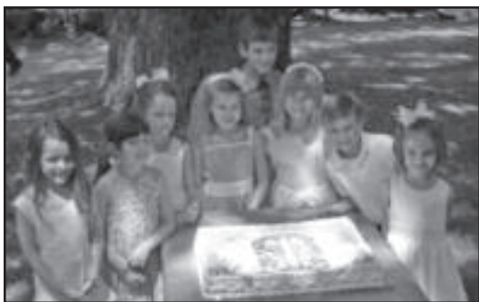
The 2007 First Communion class celebrates with a special cake.