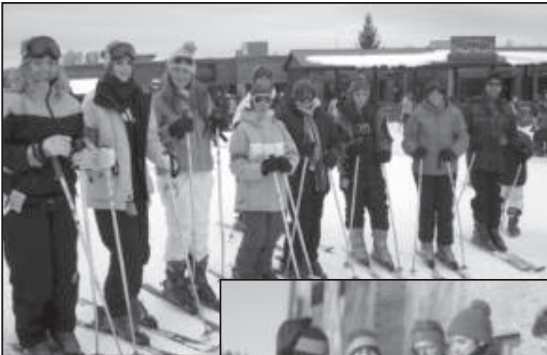
(Above left) They look like skiers, but can they actually ski?

(Center) It was 5 degrees above 0 during the early morning Eucharist. BRRR!